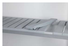
Aluminium shelves with easy to remove HDPE Slats